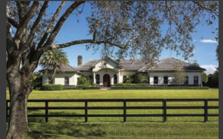
15661 Imperial Point Lane $4,500,000

Imagine yourself in the premier gated equestrian community of Palm Beach Point. The beautiful stacked stone 4 bedroom/4bath home features 4,559 square feet of expansive living space. The full restoration of this home is near completion and awaits your personal design and finishes. This property is perfectly situated on 5.68 acres of breathtaking views and landscaping. Enjoy a winning combination of the Martin-Collins footed mirrored arena, 6 generously sized paddocks and a separate barn entrance. The stylish and fully equipped 8 stall center aisle barn with breezeway is well appointed and is complete with a 1 bedroom / 1 bathroom staff apartment. The ultimate equestrian lifestyle awaits you!