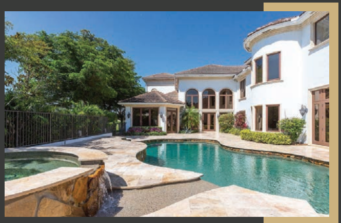
2130 Windsock Way $3,300,000

Why go to the airport... when you can bring the airport to you? Prime location with direct access to the taxiway in Wellington's premier, private, aeronautical community. Exquisitely customized with Palm Beach chic and style, reminiscent of an Addison Mizner estate, the home has only the finest finishes. Enter through the heavy hurricane impact wood, iron and glass doors and notice the 36 inch marble tiles that flow throughout the first floor. There is an array of natural wood and stone textures, complimented by the use of Chicago brick, creating a warm and inviting ambiance.